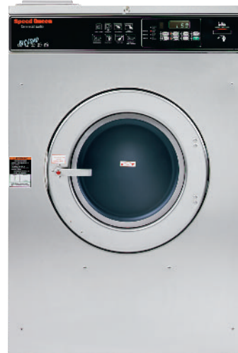
Washer-Extractor SC20NR SC25NR SC30NR SC40NR SC60NR SC80NR