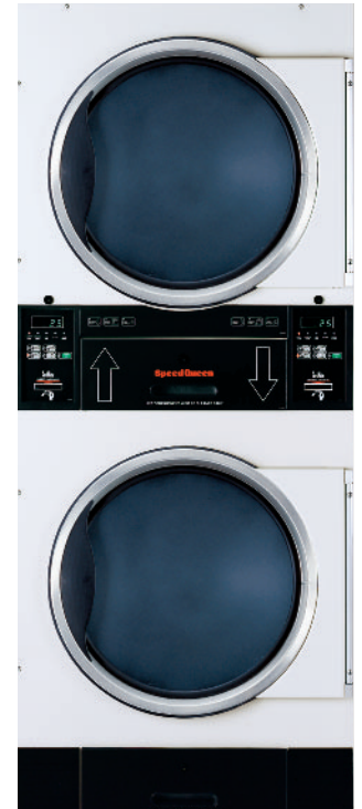
Tumbler ST030NNR ST035NNR STT30NNR ST050NNR (single unit 50 lb) ST075NNR (single unit 75 lb)