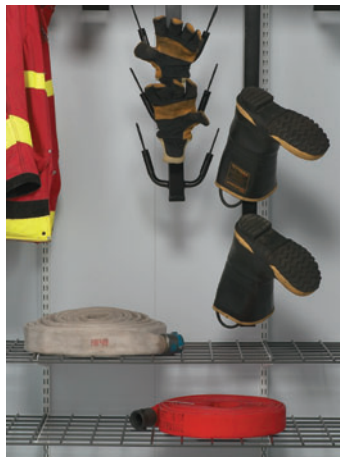
Shown with two hose racks, each rack sold separately.